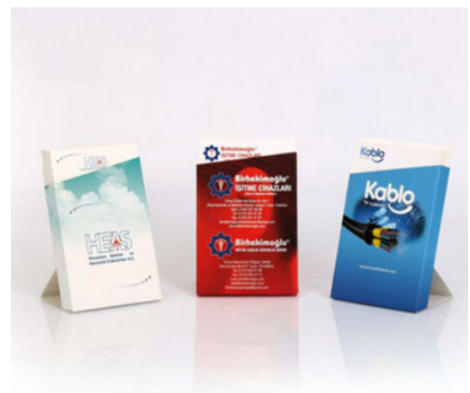
5708 - UPRIGHT NOTEPAD (60 SHEETS)