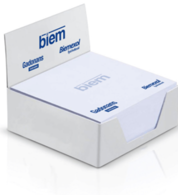
5701 - CUBE NOTEPAD (350 SHEETS)