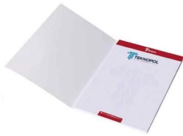
5710 - CROWN COVER NOTEPAD 15X21 CM