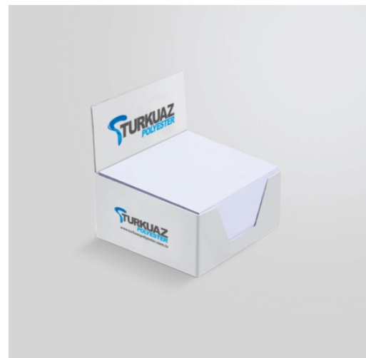
5700 - CUBE NOTEPAD (250 SHEETS)