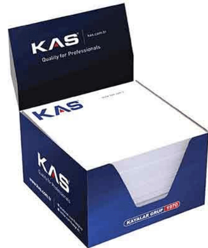
5702 - CUBE NOTEPAD (500 SHEETS)