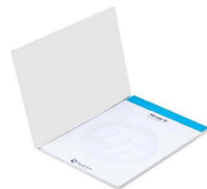
5711 - CROWN COVER NOTEPAD 9X14 CM