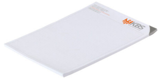
5714 - TOP GLUED NOTEPAD