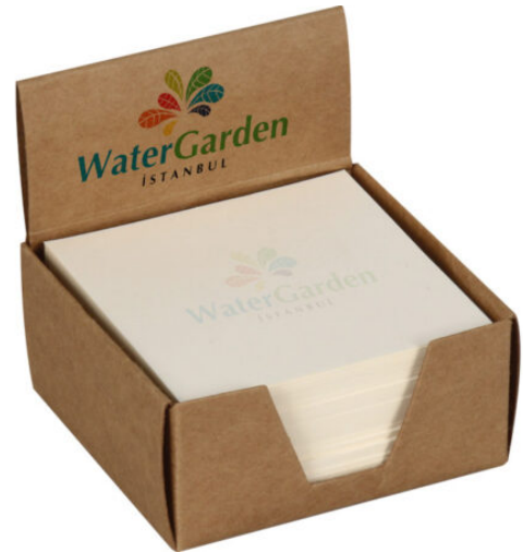
5706 - CUBE NOTEPAD (250 SHEETS)