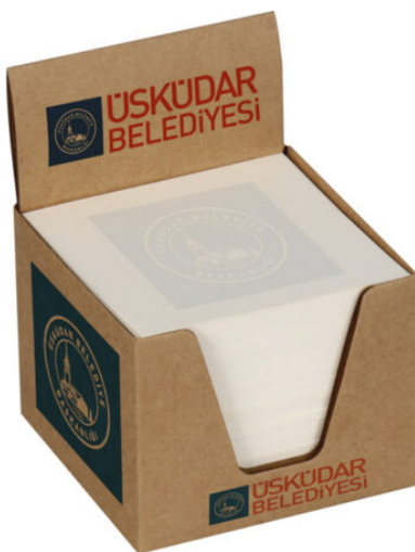
5704 - CUBE NOTEPAD (400 SHEETS)