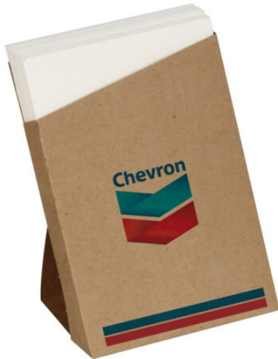
5707 - UPRIGHT NOTEPAD (90 SHEETS)