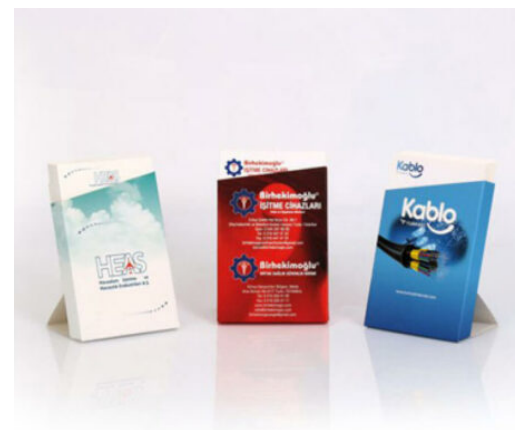
5708 - UPRIGHT NOTEPAD (60 SHEETS)