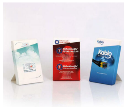
5708 - UPRIGHT NOTEPAD (60 SHEETS)