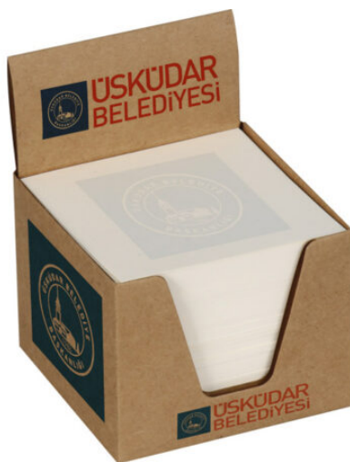
5704 - CUBE NOTEPAD (400 SHEETS)