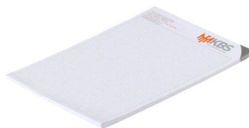
5714 - TOP GLUED NOTEPAD