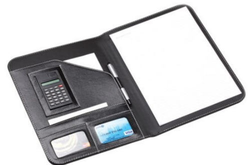
5510 - SECRETARIAL & MEMO PAD