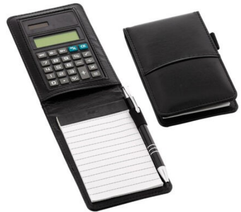
5513 - SECRETARIAL & MEMO PAD