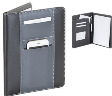
5515 - A5 SIZE MEETING NOTEPAD