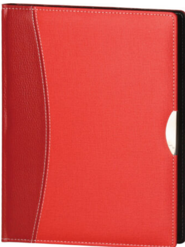
5516 - SECRETARY NOTEPAD 23X31 CM