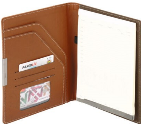
5512 - SECRETARIAL & MEMO PAD