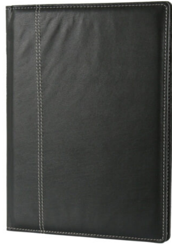
5518 - SECRETARY NOTEPAD 23X31 CM