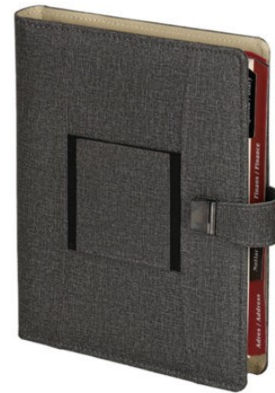
5501 - ORGANIZER WITH MECHANISM