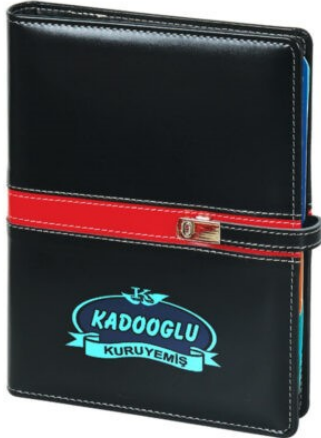
5502 - ORGANIZER WITH MECHANISM