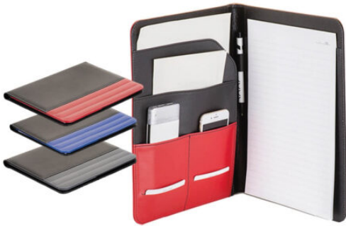
5514 - A4 MEETING NOTEPAD