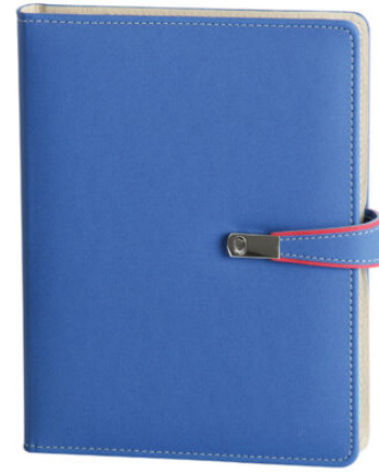
5503 - ORGANIZER WITH MECHANISM