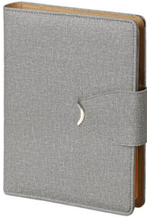
5504 - ORGANIZER WITH MECHANISM